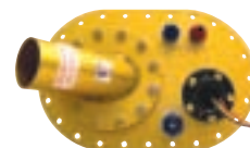
TF703 Off-set Remote-Fill Paddle Valve™ (Shown with Optional Level Sender) Add -OS to Cell Part # See Pg. 21