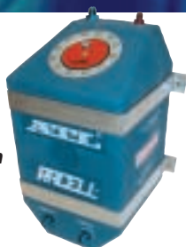
Shown with Optional Brackets